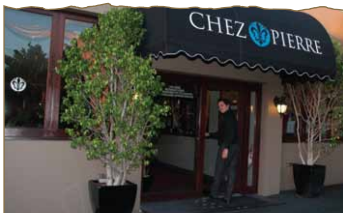
Brown Hills's second dinner at French restaurant Chez Pierre in Perth's Nedlands

Last year saw the kick-off of a new Brown Hill tradition – our wine dinners, both of which sold out in a couple of hours and were a roaring success. The inaugural dinner was in June at Perth's Gala Restaurant and the second dinner was at French restaurant Chez Pierre in Perth's Nedlands. Everyone had a great evening at both events, with a selection of museum wines available on each night. We're continuing the tradition in 2015, with our next dinner booked for 11 June at Italian restaurant Perugino in West Perth. Keep your eyes peeled for further details on our website and in your inbox.